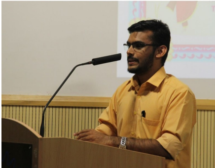
Student's Speeches about their mother tongue!